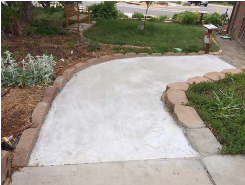
Complete ... Job Well Done! 😊