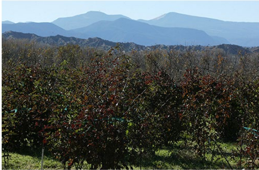
SASC Orchard and Nearby Mountains

The Sustainable Agriculture Science Center at Alcalde has several projects under way. Below we have information and links to the most recently completed or nearly completed projects and their results.